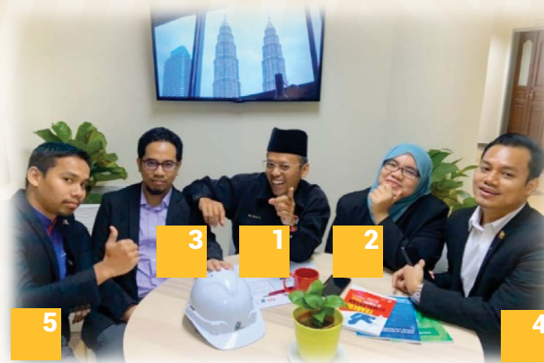
(This report was prepared by Secretariat of AOSHRI Progress Meeting 2019: