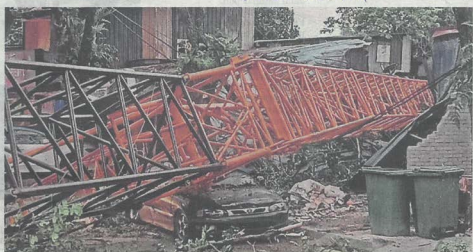
Kren berantai tumbang menghempap rumah dan kereta serta menghalang laluan di Bandar Baru Sentul, Kuala Lumpur, semalam.

Jentera berat hampap 3 rumah, dua kereta dekat tapak projek kondominium