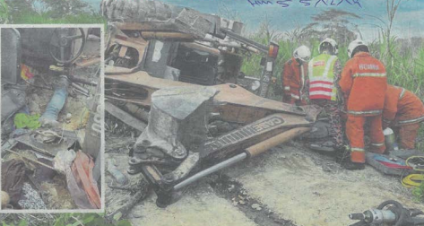
ANGKOTA bomba bertungkus-lumus mengeluarkan mayat mangsa yang dihempap jengkaut.

Lelaki maut dihempap kenderaan dikendalikan ketika kerja